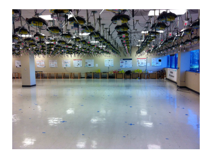
Figure 1. 10 wireless transmitters and 6 receivers are deployed in this 20 \times 20 m open space.