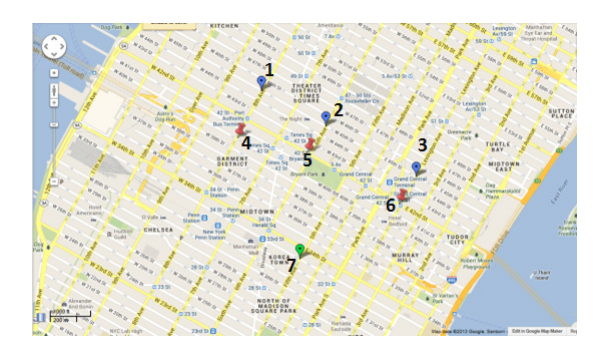
Fig. 2. An example wireless backhaul network in downtown Manhattan scenario. Blue, green balloons and red markers denote edge, gateway and candidate aggregator node locations respectively. Our objective is to minimize the aggregator node deployment cost while ensuring the network connectivity between edge and gateway nodes. Figure taken from [13]

In [8], the authors assume a radius coverage based propagation model, and deploy sensor and relay nodes optimally among an unconstrained number of candidate locations to solve the connectivity and routing problem. The authors of [9] deploy sensor and relay nodes among a constrained set of candidate locations but assume a radius coverage based propagation model. The authors of [10] solve the relay placement problem in WLAN with uniformly distributed mobile users. In [12], the authors solve relay placement problem in IEEE 802.16j networks while assuming an arbitrary user distribution and distance based propagation. The authors of [11] also focus on IEEE 802.16j networks, assume nomadic relay nodes and place relays for time varying user demand.