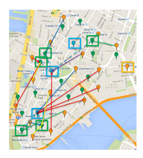
Fig. 6. Network connectivity when edge nodes transmit in 5.8 GHz and aggregator nodes transmit in 60 GHz. Figure taken from [13]